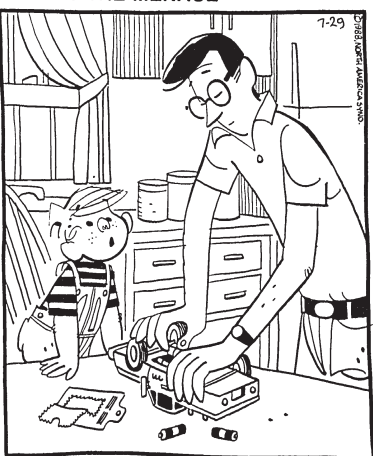
"WHAT DO BATTERIES RUN ON?" © North America Syndicate. Reproduced by permission.