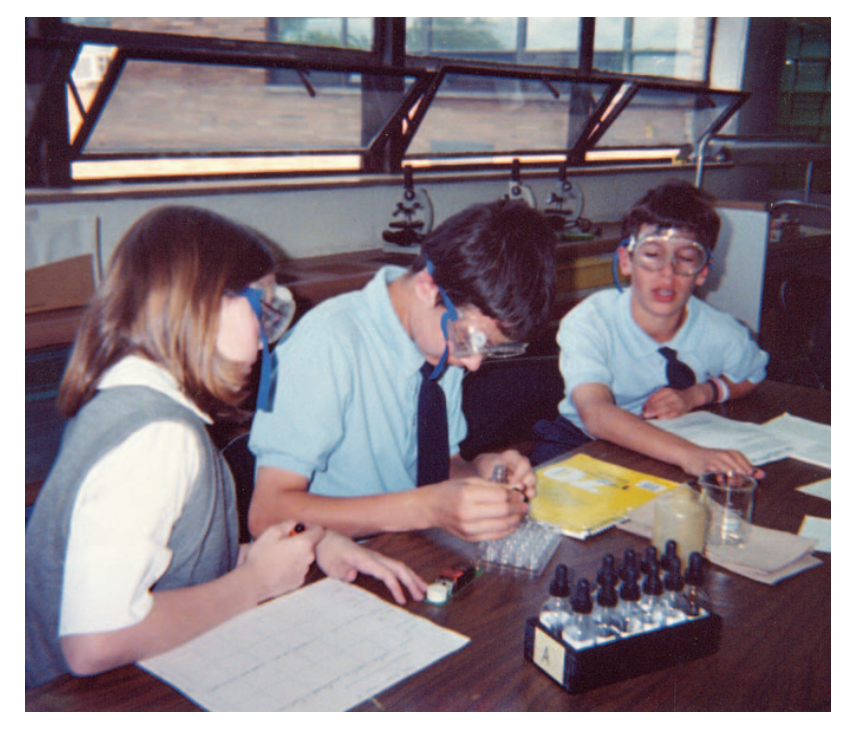
FIG. 2. Conductivity experiment in progress. Middle scientist is testing solution in well-plate with a blinking LED indicator. Test solutions in dropper bottles and data sheet are also shown.

In vet another experiment (Fig. 2), students were given a variety of relatively inexpensive conductivity indicators available in the educational catalogues, including a ringing bell of variable intensity and pitch, and two different blinking LEDs (red light) of variable intensity and frequency (http://www. sciencekit.com; http://www.lab-aids. com). Students (4-6 graders) received a set of solutions of acids and bases, and a salt, of various concentrations, and well water, orange juice, milk, and a few soft drinks, together with two different types of indicators and a data sheet. Students were encouraged to use their own words to describe the outcome of their experiments, in terms of what they heard or saw. Once the initial thrill of listening to the ringing bell had quelled, students, appropriately classified, with little guidance, the responses obtained with the various solutions, as loud, medium, no sound, extra loud, and soft.