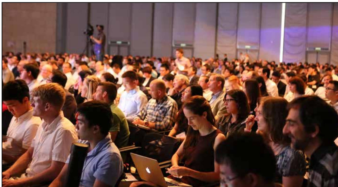
Conference attendees in the main presentation hall.