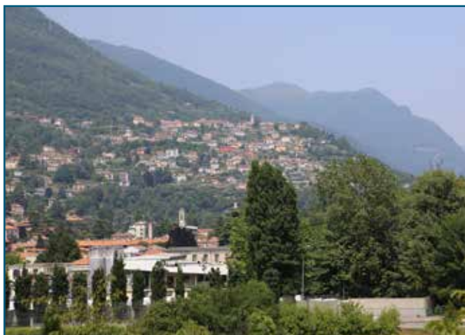
The view of the Italian countryside from the Grand Hotel di Como.