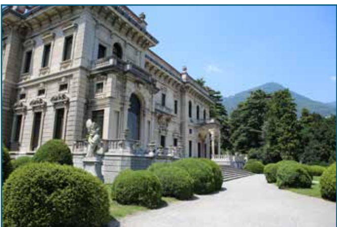
The Villa Erba Antica, site of the gala dinner.