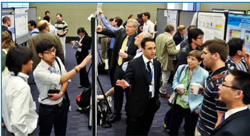
A view of the first ELECTROCHEMICAL ENERGY SUMMIT POSTER SESSION at the ECS meeting in Boston.